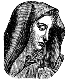
Month of Our Lady