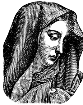
Month of Our Lady